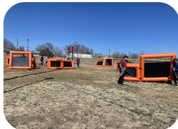
Laser Tag, thanks to Los Alamos Teen Center