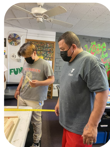
Hanging out after Easter Egg Hunting